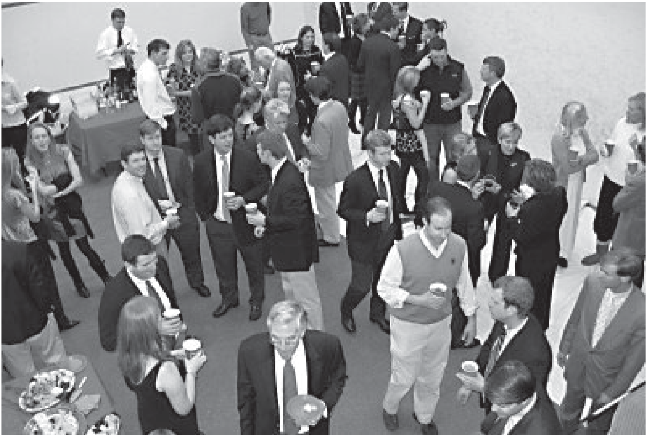
Union Boat Club Second Annual Holiday Party

will feature men's and women's, rower and non-rower, and open and handicapped winners. The award ceremony will be at 7:45 pm., and pretzels, popcorn and beer will be available for those who have finished their piece. We had 30 participants last year, and are hoping to double that again this year- which we can do with your help- so please attend if you can. Sign-up sheets will be up soon, and if you can come at the last minute, please do so.