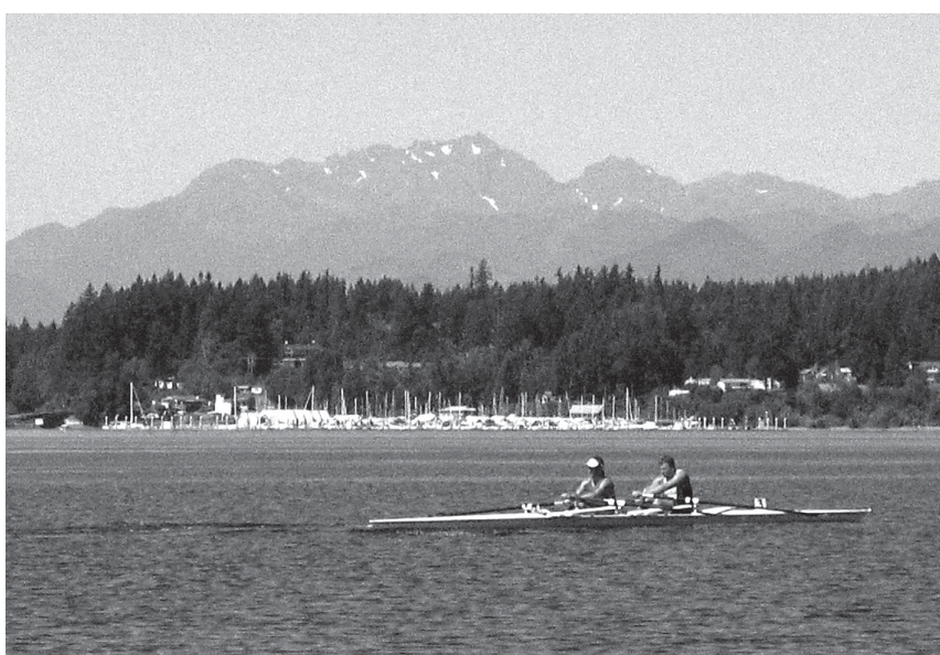
Cascade Mountains Loom Over 1st Annual Open Rowing Championships